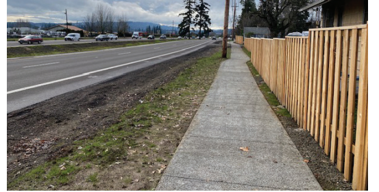
Hwy 99W: Pony Ridge Neighborhood to 124th Ave