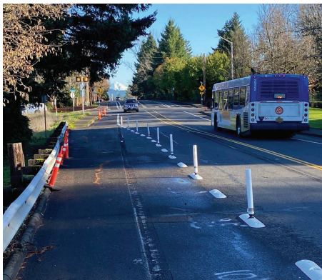
Sagert St Bridge/I-5 Walkway