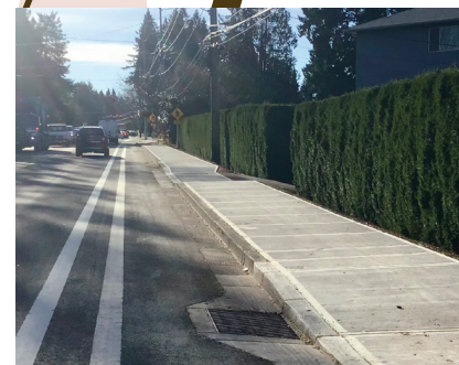
Boones Ferry Corridor Sidewalk and Lane Project