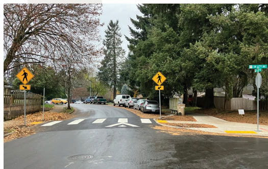
67th/68th Ave Loop at Stoneridge Park