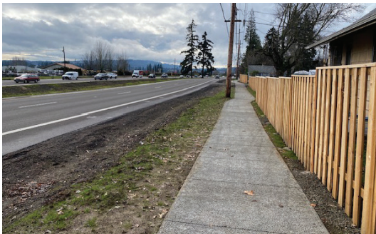
Hwy 99W: Pony Ridge Neighborhood to 124th Ave