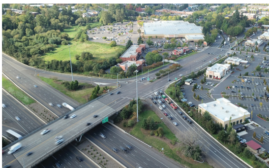
Tualatin-Sherwood Rd: Martinazzi Ave to I-5/ Nyberg St