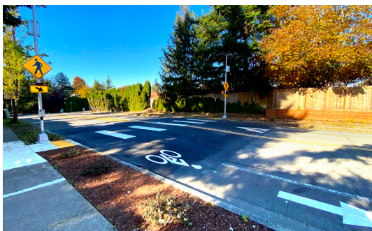
50th Ave and Wilke St