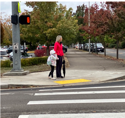
95th Ave and Avery St