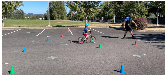
27 children attended the Tualatin Elementary School's Bike Rodeo in September 2022 to celebrate project completion.

"Yay!!!! Thank you SO much!!!" Melanie M.