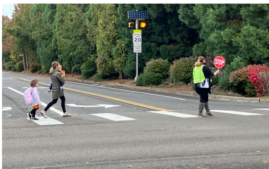
95th Ave and Avery St