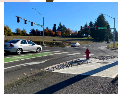
Martinazzi Ave and Sagert St