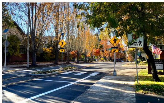
Tualatin Rd: Sweek Dr to Community Park