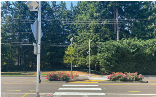
Boones Ferry Rd at Arapaho St