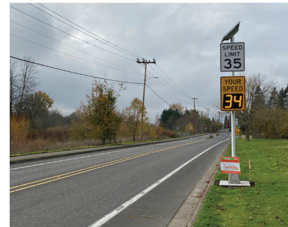
Nyberg Ln at 57th Ave