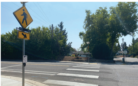
Sagert St at 72nd Ave