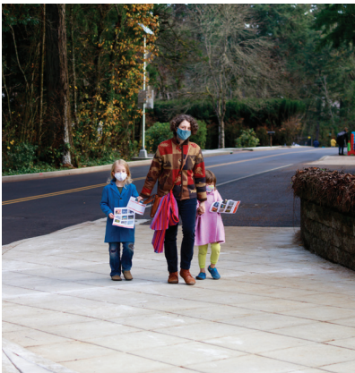
Garden Corner Curves