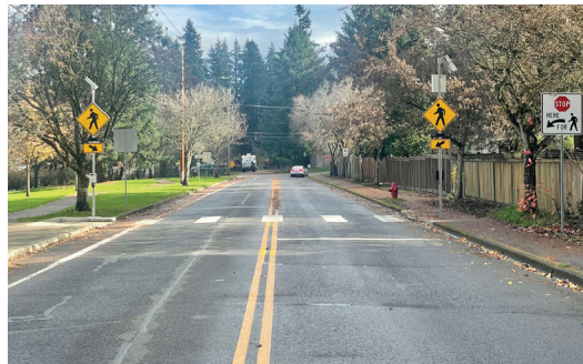
Hazelbrook Rd Crossing