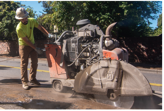
Garden Corner Curves