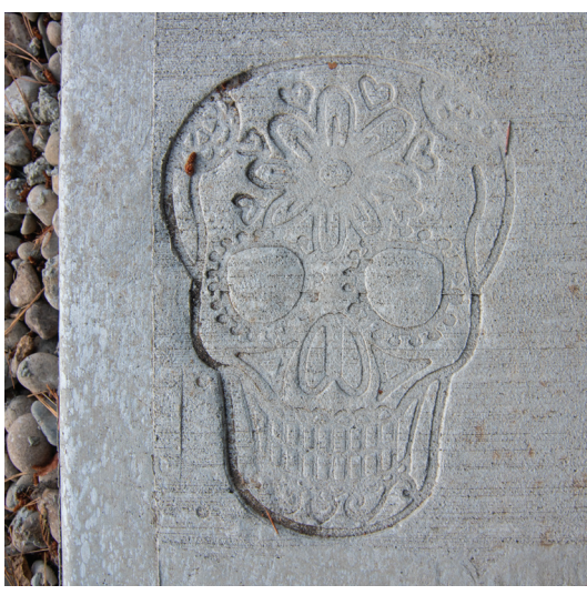
Sidewalk art installation