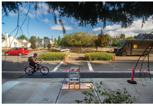
Tualatin Road: between 105th Ave and 115th Ave