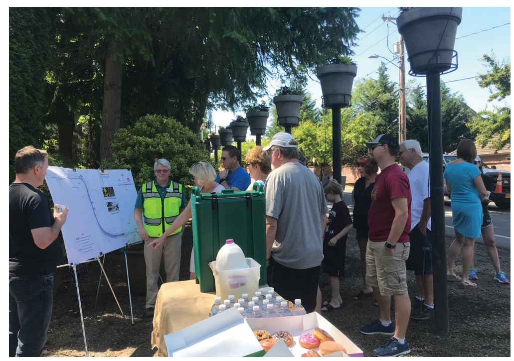
The Garden Corner Curves project was designed with extensive community input

The anticipated project cost is $3 million. It will be funded by the $20 million Tualatin Moving Forward bond program approved by voters in May 2018. Fourteen bond-funded projects have been completed and another eight projects are underway.