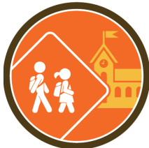
SAFE ACCESS TO SCHOOLS