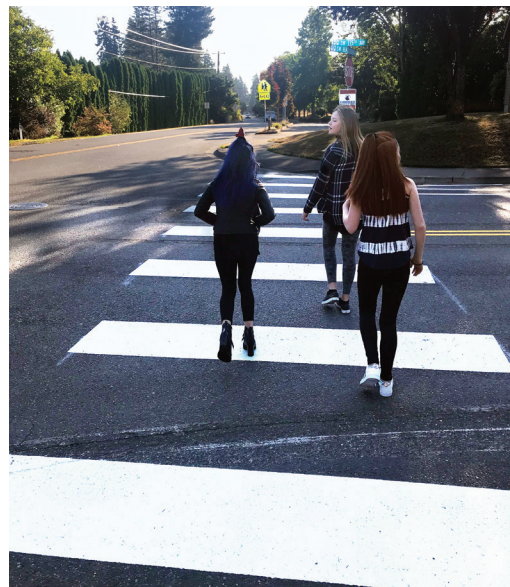
New pedestrian crossing and bicycle lanes installed near Hazelbrook Middle School